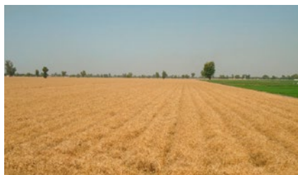
Dr. Shafiq Ahmad

Intercropping: Wheat planted into cotton fields; last irrigation flow for cotton serves as initial irrigation for following wheat.