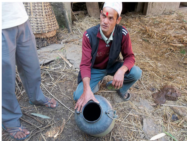
Cattle urine collection for improving soil fertility, October 2013

In order to bring technological knowledge of sustainable land management to the farmers, SSMP developed a decentralised system of agricultural extension at community level, a so-called Farmer-to-Farmer approach (FtF) .