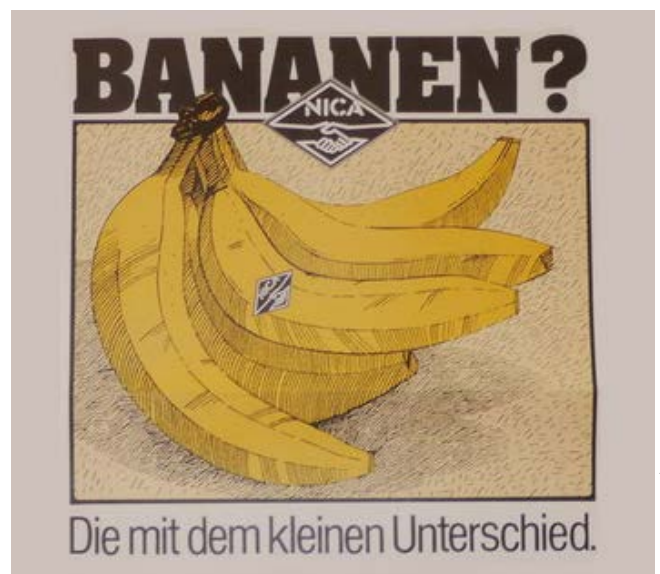
Switzerland. Logo for fair trade bananas (1986)

During the 1960s and '70s important sections of the fair trade movement worked on persuading retailers to include products in their range or create markets themselves for products originating in countries which were cut off from international trade for political reasons. Thousands of volunteers sold coffee from Angola or bananas from Nicaragua. They sold in fair trade shops, in churches, from their homes and at retail outlets in public spaces. Ever since then, fair trade in Switzerland has grown on average by ten percent every year.